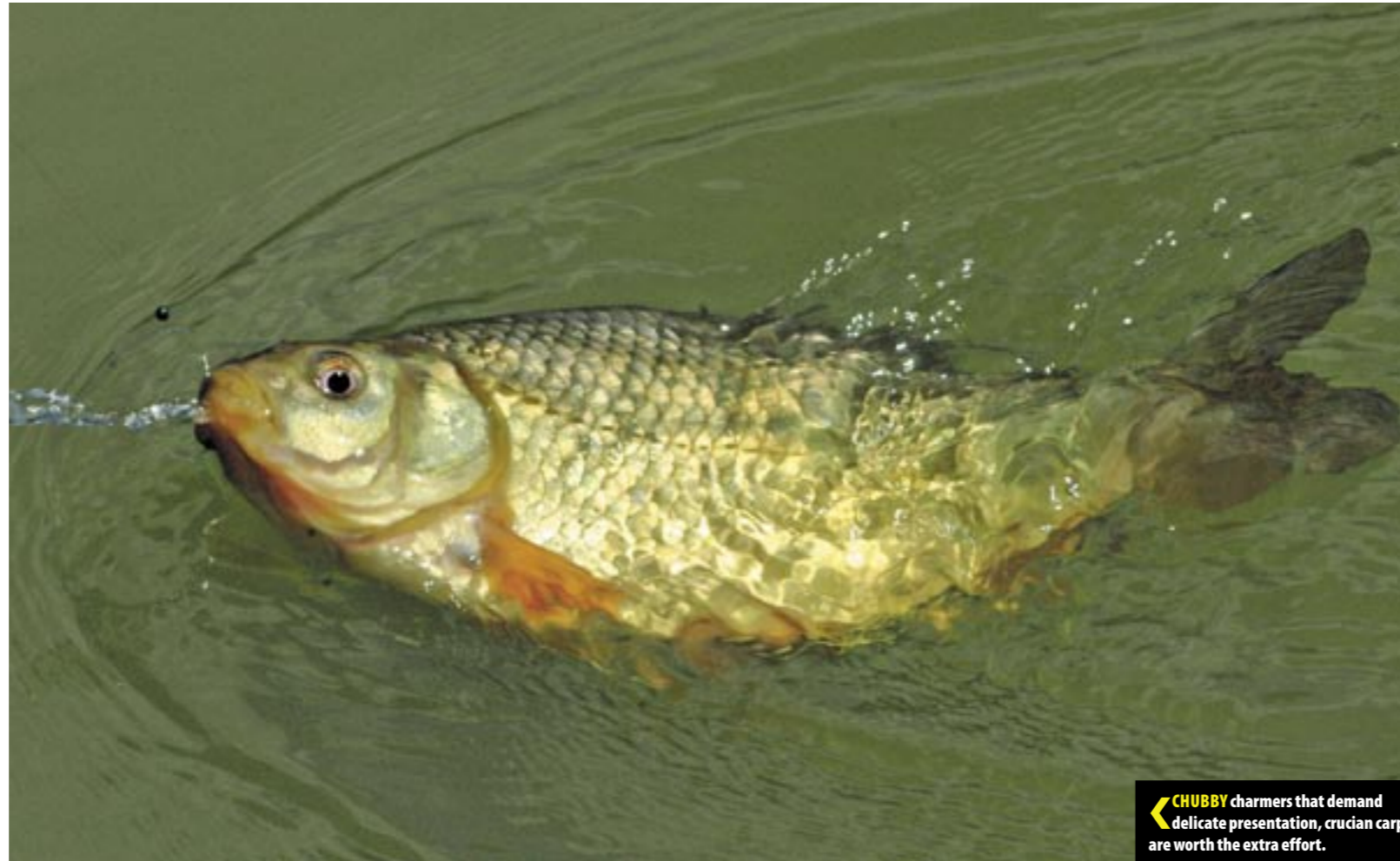
CHUBBY charmers that demand delicate presentation, crucian carp are worth the extra effort.

Angler's Mail RATING: Delicate presentation makes all the difference.