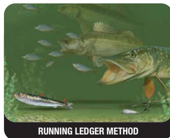
RUNNING LEDGER METHOD