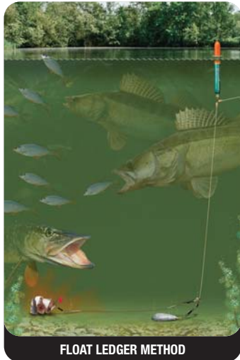
FLOAT LEDGER METHOD

second rubber float stop on the line to hold the float at the required depth. Next slide an Olivet or small bullet weight onto the line to weigh the float down, but remember to allow for the weight of your bait, particularly if you intend to suspend the bait for drifting. If you are using a sliding weight, add a rubber shocker bead between the weight and the swivel to protect the trace knot from chaffing before tying on your trace, which should have a swivel already attached, preferably using a grinner knot (see knot advice above).